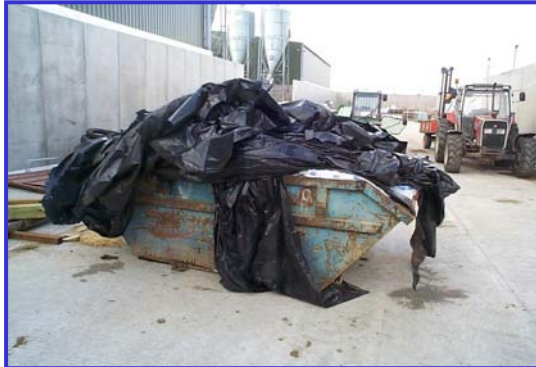
6 cu yd skip containing 400-450kg waste plastic ...