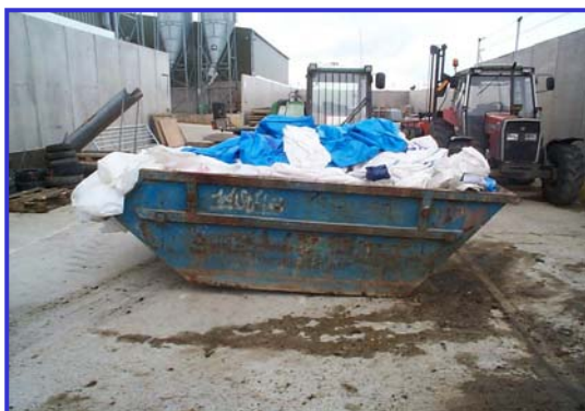
600kg polypropylene IBC fertilizer bags: 220 inner and outer bags filled a 6 cu yd skip.