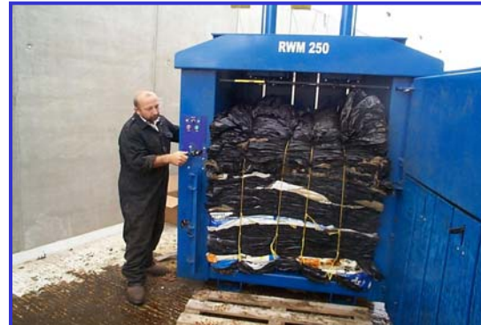
... reduced to a single bale.