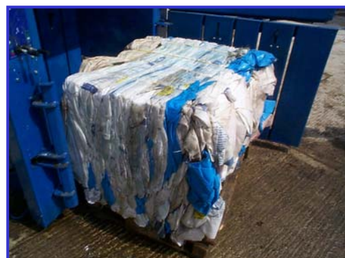
220 outer bags reduced to a single bale weighing 236kg.